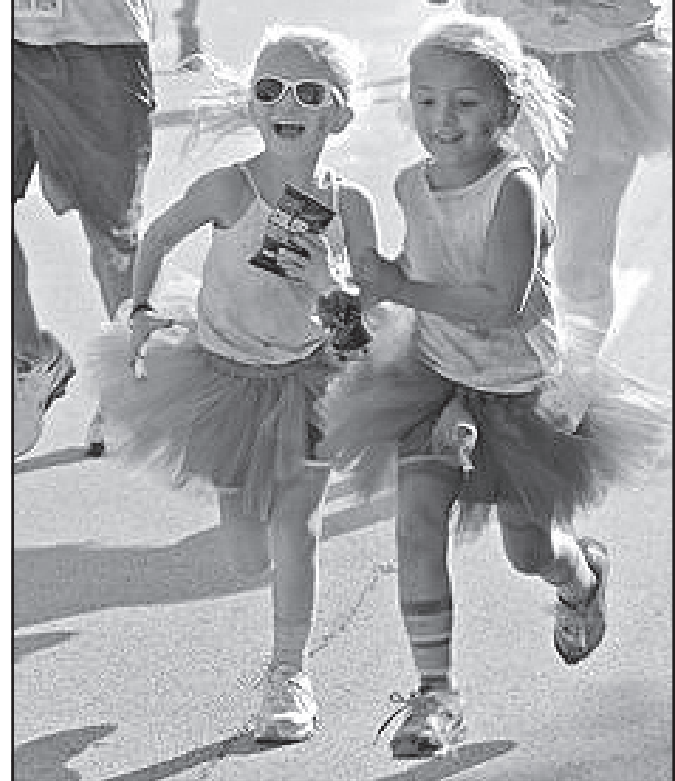
Color Run... for all ages and Bellview Home Furnishings of Murphy, NC.

Thank you to our sponsors: Young Harris Early College